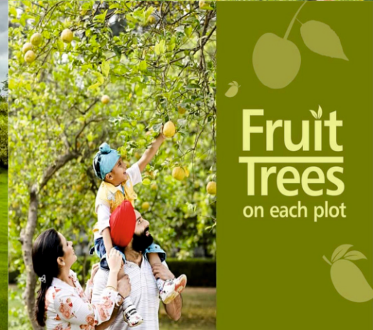
Fruit Trees on each plot